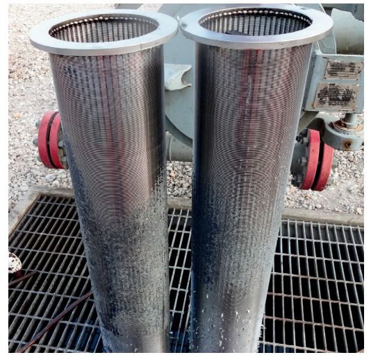
The magnet is a stainless steel tube magnet that pulls metal particles from the system (left). The filter element is a bag-type filter made of 316L stainless steel (right).

According to Hopkins, the idea is to have one element for everything. “If an operator has 60 engines in a plant, they will each use the same Duration filter element regardless of the engine manufacturer. If they have any application and are running a 50-micron filtration, it’s also the same element. We make filtration simple by designing our filter elements to fit any of our housings. Spares are based on what is needed at the facility. They may only need four spares for 60 engines. When a mechanic comes in to do planned maintenance, they pull the filter element and put in the spare. They take the filter element they just pulled and clean it, and now that becomes the spare. It doesn’t matter if that element went to the engine or the amine or any other process, it is clean,” said Hopkins.