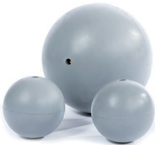
Model: SP1 SPHERICAL PIG

The PEI spherical pigs are cast in a single piece. The 6" and larger spherical pigs are hollow which must be liquid filled and inflated through one of the two inflation valves. The OD selected should be less than pipe ID. This allows them to be inflated to pipe ID which improves performance and prolongs services life.