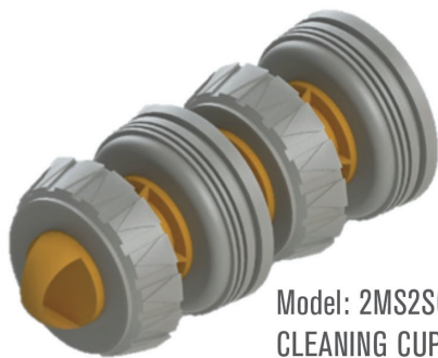
Model: 2MS2SC CLEANING CUPPED PIG